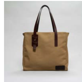
Adjustable Canvas Tote