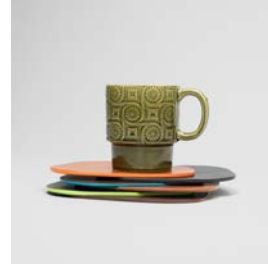
Coaster Set (4)