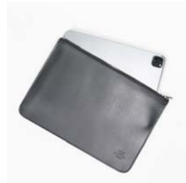
Small Document Holder